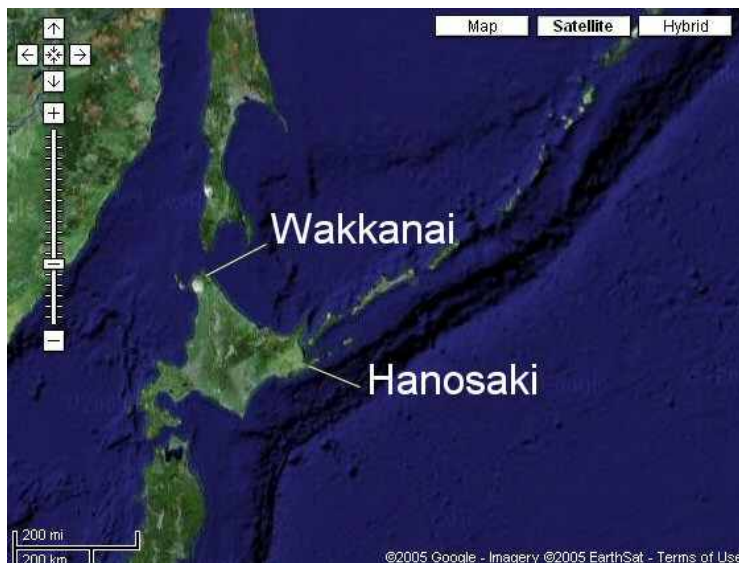
Figure 1: The Island of Hokkaido.

slower product flows which support price stability, and are seasonally affected by ice conditions from about mid-October to the end of March each year. In contrast, much of the product coming into Hanosaki is not affected by ice and is not regulated with the result that large landings often glut the market throughout the country between October and January, causing price declines and disrupting the market so much that regulated sources are rendered uneconomic. This has particularly affected the market for live Canadian Green Sea Urchins (GSU) as demand for higher priced product has basically collapsed in response to the increased IUU supply.