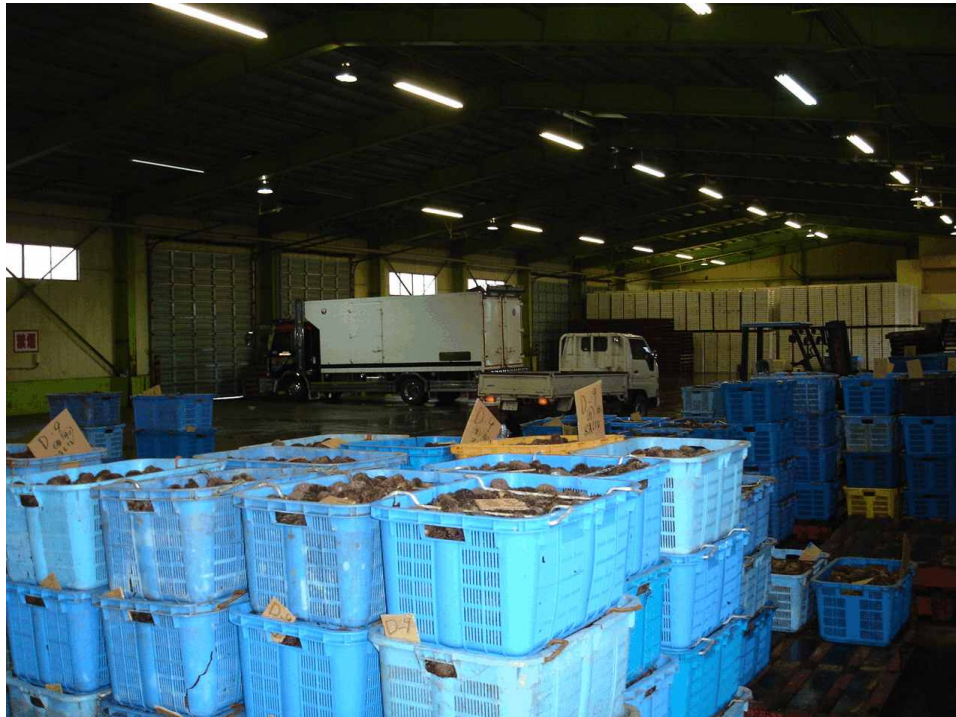
Figure 12: Totes of urchins in the Hanosaki FCA warehouse.

Excise taxes are charged on scallops (5%), shrimp (1%) and crab (4%) to limit competition with domestic producers while some other seafoods are not allowed in at all. The urchins have a remaining shelf-life of up to about 10 days if they are handled properly. The same expectations are likely true for GSU caught in Canada but the net shelf-life is shorter in this case because