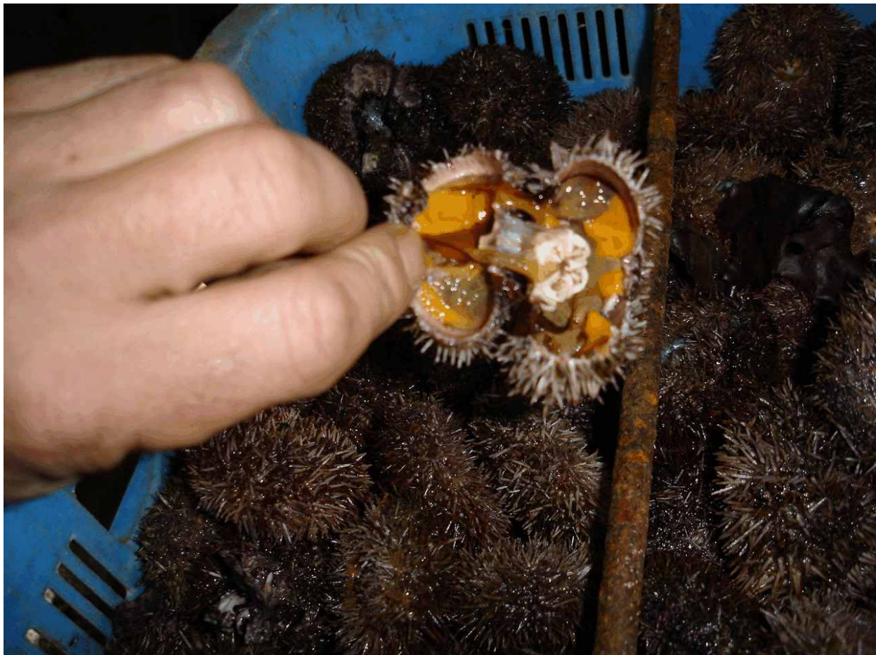
Figure 9: S. intermedius sea urchins from the Russian IUU fishery.

The total weight landed this day was about 80 MT and for the week about 300 MT, enough to glut the market and depress market prices even in Tokyo on the Tsukiji market to between ¥100 - 200 for a 200 gram tray. The urchins provided by the Russians is a traditionally used species known as the Japanese Green Sea Urchin, Strongylocentrotus intermedius , with small reddish-yellow gonads which have a nice sweet taste. The minimum 40 mm TD size for the urchins is defined in the delivery contracts between the Russians and their Japanese buyers. The product quality for these urchins generally peaks in April-May at about 15% vs around 5-6% now (Figure 9). The urchins also seem to have lots of feed in them right now suggesting good feeding conditions. We did not enquire about the landed prices but the CIF prices at a number of plants are currently reported at between about ¥200 - 300 per kg. This would imply a landed price of about ¥150- 225 per kg with about 15-20% added in for import duties and transport.