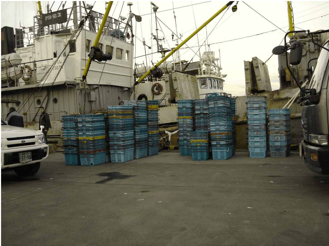
Figure 10: Nested urchin cages ready for loading and stowage on a Russian packer.

MT. These are apparently either hand-bombed or otherwise lifted down to pallets on the jetty where they are taken by forklift to the storage warehouse owned by the Hanosaki Fisheries Association Cooperative Wholesale Market where they are held pending payment of the import taxes - a one time landing/import fee not influenced by weight, assessed by the customs officials and other agent and unloading fees prior to their removal for transport and distribution to various processors (Figure 12).