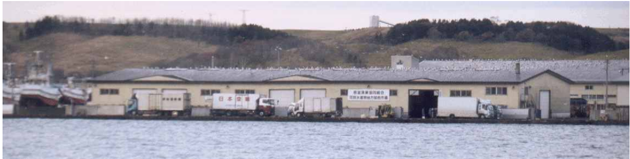
Figure 7: Main unloading jetty backed by the Hanosaki Fisheries Cooperative warehouse and with the winter storage rails to the left.

taxes are paid. There are about 10 companies importing the product but some of these use the same processors so it is difficult to determine exactly where the product is going, and because of the nature of the organizations allegedly involved (Russian mafia and Japanese yakuza), it seemed prudent to limit the questions we asked.