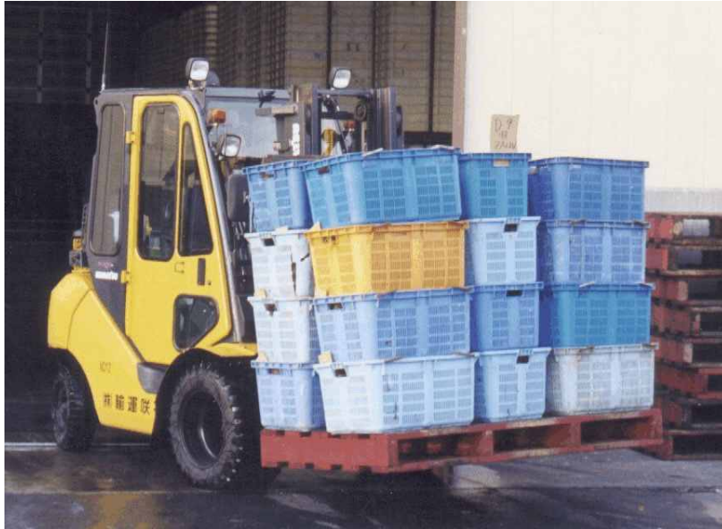
Figure 14: Forklift moving about 20 cages, or about 700 kg., of urchins from warehouse to truck.

of lift trucks seen in the port and a couple of the boats had booms with winches so one can only speculate on the extent of equipment used vs. hand-bombing and the actual rate (in kg/hr) the product is moved off the packers. We did however see the catch being moved off a large crab ship and it seemed that individual cartons were hand-bombed up onto the deck and moved, again by hand, onto pallets held aloft by a forklift. This might be the norm on the Russian boats as the