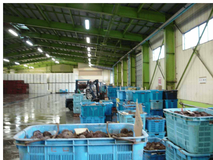
Figure 13: More urchins in Hanosaki warehouse.

there is at least one full day needed post-harvest to get the product to Hokkaido. The Russian vessels generally arrive in the port by about 0700 hours and the unloading is generally completed by about 1000 hours. Deliveries were generally restricted to Mondays and Thursdays in past years but the customs department in Nemuro/Hanosaki was recently upgraded and deliveries are now