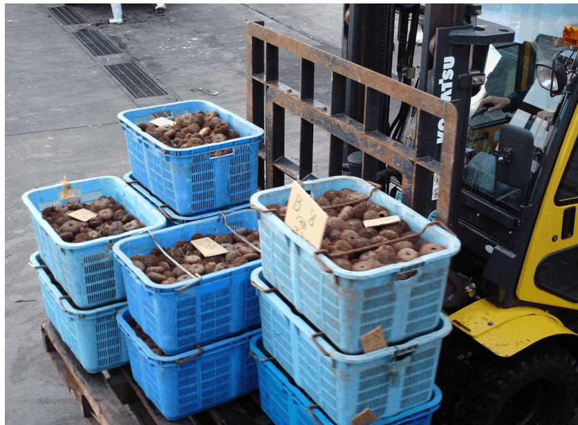
Figure 11: Stacked cages with handles in filled configuration.

MT. These are apparently either hand-bombed or otherwise lifted down to pallets on the jetty where they are taken by forklift to the storage warehouse owned by the Hanosaki Fisheries Association Cooperative Wholesale Market where they are held pending payment of the import taxes - a one time landing/import fee not influenced by weight, assessed by the customs officials and other agent and unloading fees prior to their removal for transport and distribution to various processors (Figure 12).