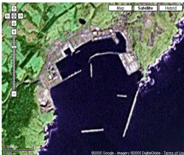
Figure 4: Smaller scale satellite view of Hanosaki Port.

The delegation representing PUHA and the WCGUA viewed the unloading facilities and the tail end of an urchin packer unloading operation in Hanosaki Harbour just outside of Nemuro on the east coast of Hokkaido (Figure 3). The port is a major fishing harbour and services a number of domestic and foreign fishing vessels, landing sea urchins, crab, salmon, pollock, cod, scallops, clams etc. This port is on the southern coast of the Nemuro Peninsula and, because it is only about 30