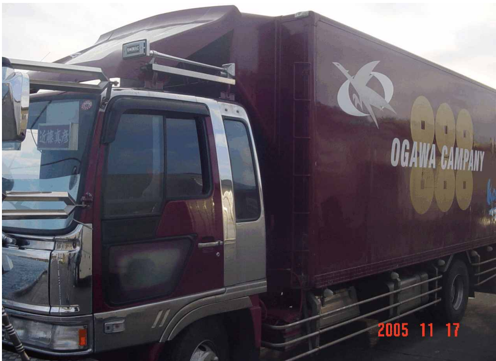
Figure 17: One of the trucks used in Hanosaki to transport the Russian urchins