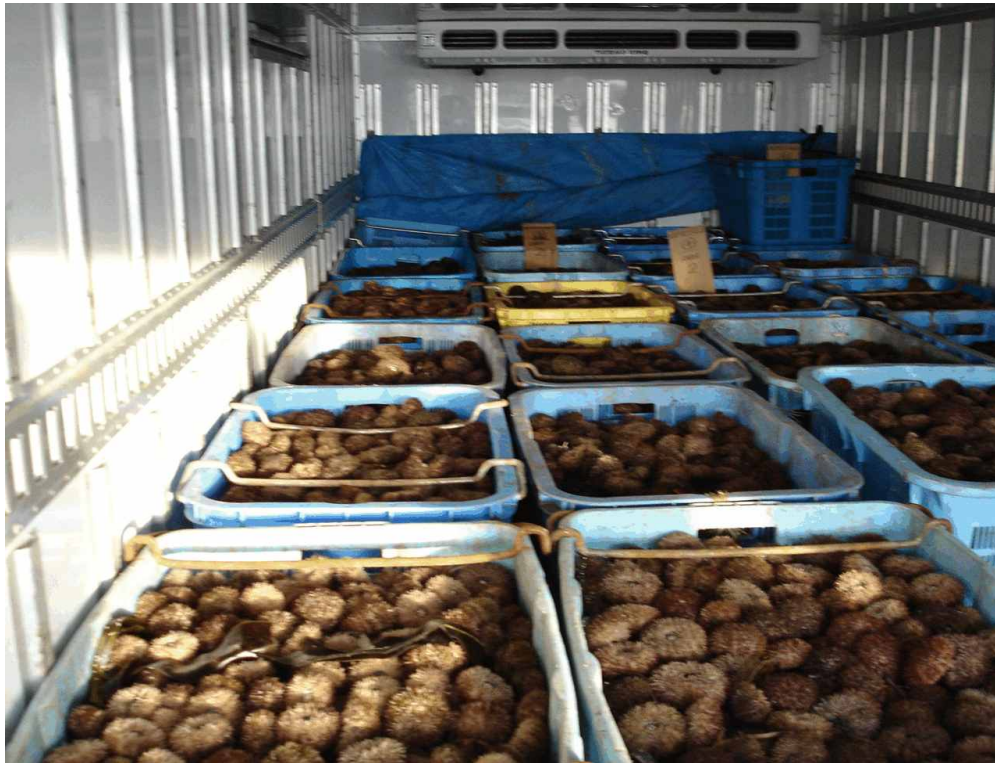
Figure 16: Interior shot of truck box with loaded product. Reefer unit can be seen along front wall.