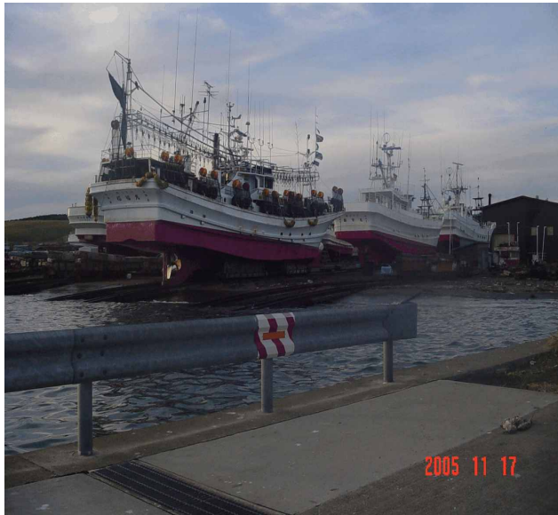
Figure 5: Boats on rails for winter storage.

The approaches to the harbour are protected by a series of breakwaters and construction of harbour infrastructure is ongoing. There are six main jetty areas including an outer jetty for unloading large trap and trawl vessels (250 to 450'), a ~0.5 km 2 sub-basin on the NE part of the harbour for smaller fishing vessels (~ 35 - 80'), the main unloading basin with a number of warehouse facilities etc and a vessel storage area in the central part of the harbour. There is another jetty along the western edge of the harbour where foreign vessels were tied up and re-supplied during their stay.