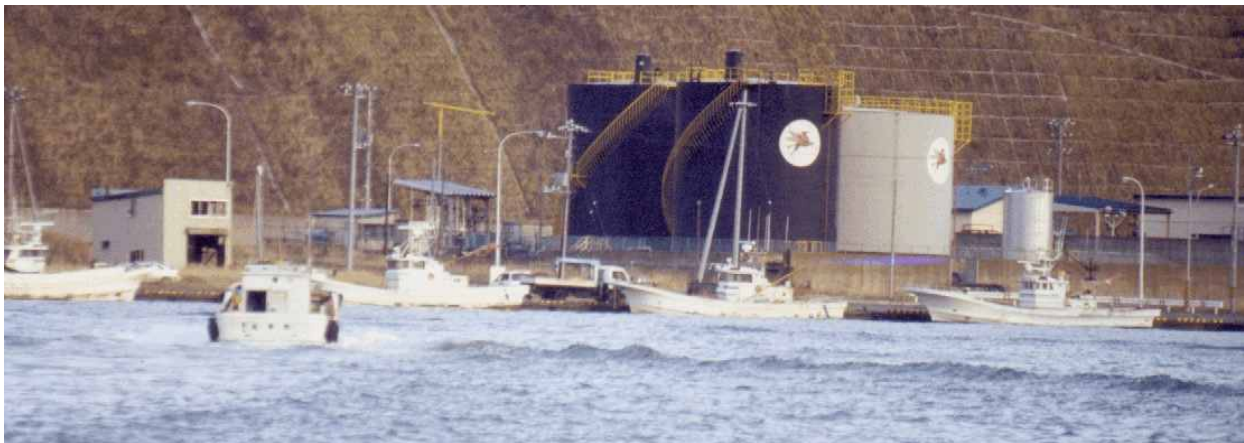
Figure 6: Fuel storage silos along eastern shore of Hanosaki Harbour. Note also the Japanese inshore fishery fishing vessels (~40 - 50') used by local fishery cooperative association(s).

There were probably several hundred vessels in the harbour including perhaps 75 Japanese vessels, including squid boats (length ~ 80') and other vessels ranging in size from about 40 -150', which were run up on rails onshore for winter storage (Figure 5). There appeared to be number of buildings where the vessels could be worked on around the perimeter of these areas. There are also a number of fuel depots (Figure 6) and chandlery businesses in the area, supporting the claim that other sectors in the local business community derives significant benefits, and is at least somewhat dependent on, the Russian IUU fishery. Fishing harbours in Japan are unfailingly impressive in the extent and calibre of the facilities they provide to the commercial fleets.