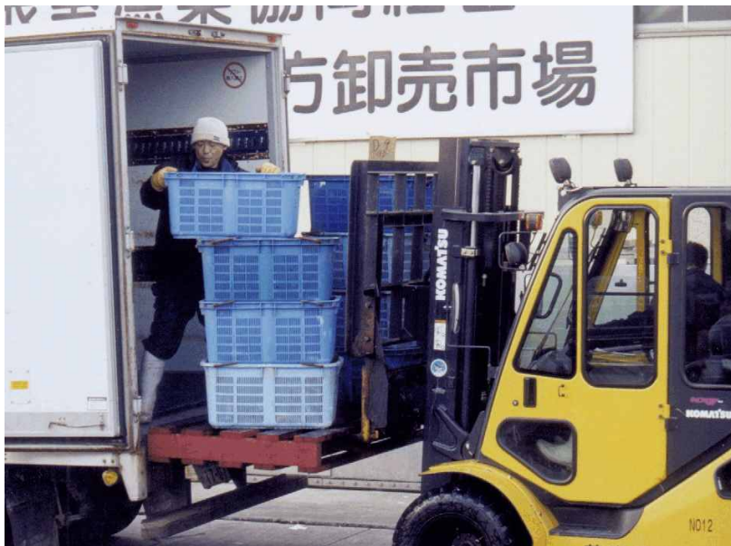
Figure 15: Hand-bombing cages from forklift into truck.

author has observed on a number of occasions that Russian practices generally favour low tech with lots of manpower.