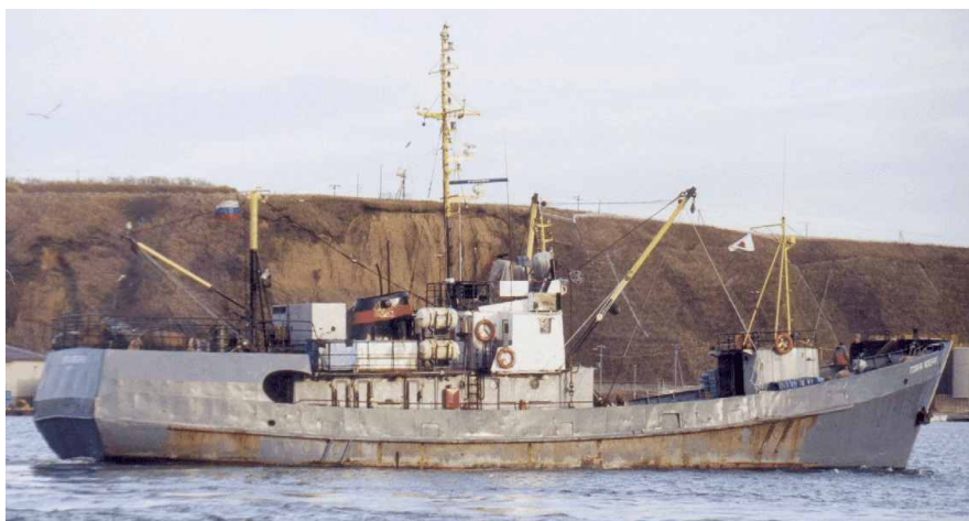
Figure 8: A Russian packer in Hanosaki Harbour.

On the day we visited, five vessels, each with between perhaps 14 - 20 MT of IUU urchins, were unloaded. Vladimir Putin is visiting Japan early next week and the Russian Coast Guard (RCG) is reported to be increasing its presence along the border areas to intercept and stop deliveries for at least the duration of his visit but there was some thought that the packers would be stepping up their deliveries in advance. Other sources reported deliveries into Hanosaki on the Monday following our visit, the day after President Putin arrived in Tokyo, totalled 150 MT. The ease with which this product is landed fairly strongly suggests that the RCG efforts were not, and are not likely to be, particularly effective.